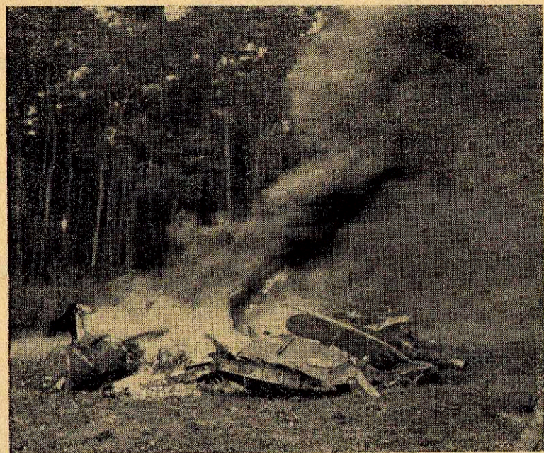
The dying Luftwaffe came to life from time to time during the 83rd's dramatic dash from the Rhine to the Elbe—but not for long—as this funeral pyre, vivid testimony of the accuracy of 453rd AAA gunners, proves.

The Nazi commander, a lieutenant, said "Hitler can well be proud of these men for holding out as long as they did. They proved to the Fuehrer, beyond doubt, that they still love him."